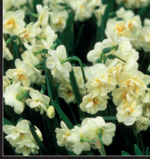
N. 'Sir Winston Churchill' ① [Div. 8]