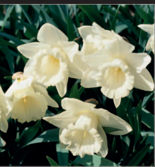
N. 'Mount Hood' ① [Div. 1]